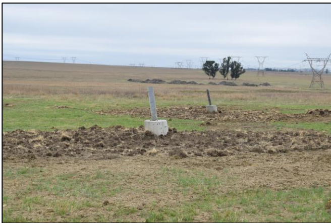
Figure 6: Backfilling