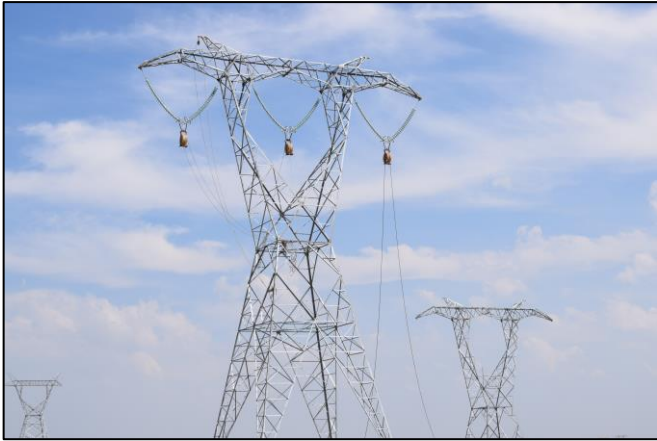
Figure 2: Stringing activities