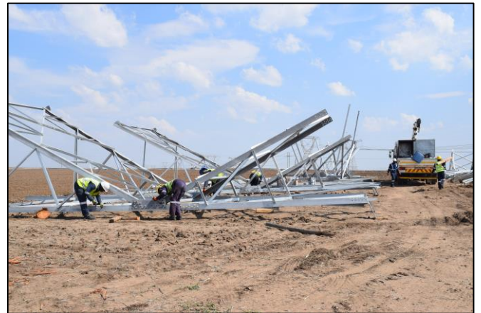
Figure 5: Assembling towers