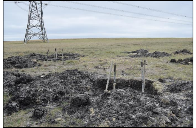
Figure 3: Micro-piling