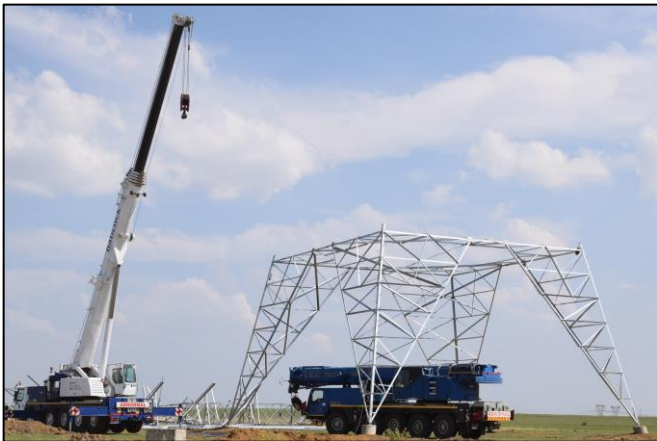
Figure 4: Tower Erecting