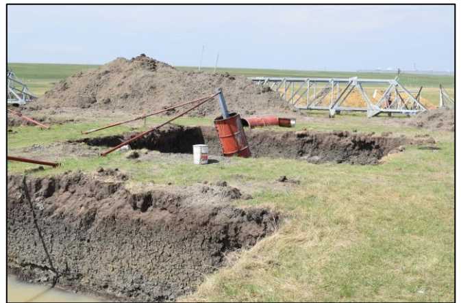
Figure 7: Shattering completed on V-blocks